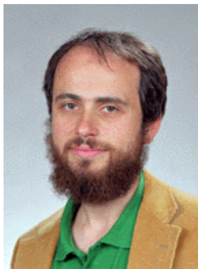
TESTING ALPHA Dmitry Budker

The stakes are high. “The strongest implication of varying constants is that the forces of Nature cannot be universal or eternal,” says Ubachs. Budker adds: “It’s hard to underestimate the importance of such a find. Scientists would have to go back to the drawing board to rewrite basic physics principles.”