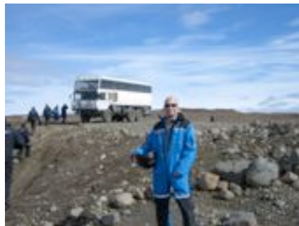
HIKING A GLACIER At the FQXi Conference