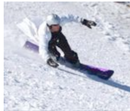
CONVERTING POTENTIAL TO KINETIC ENERGY