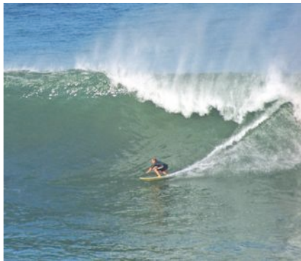
WAVE THEORY EXPERT

Or maybe it doesn't seem so familiar to you after all? You're not alone. Twentieth-century physics taught us that there's a whole lot about the basic structure of our universe that doesn't look the way we thought it did.