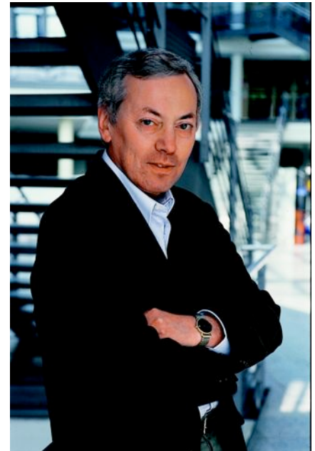
ALEXANDER VILENKIN Tufts University

First, it has negative pressure. That is, when a force like gravity tugs on dark energy, dark energy tugs back. This rubber-band quality of dark energy has caused some scientists to describe it as a kind of anti-gravity.